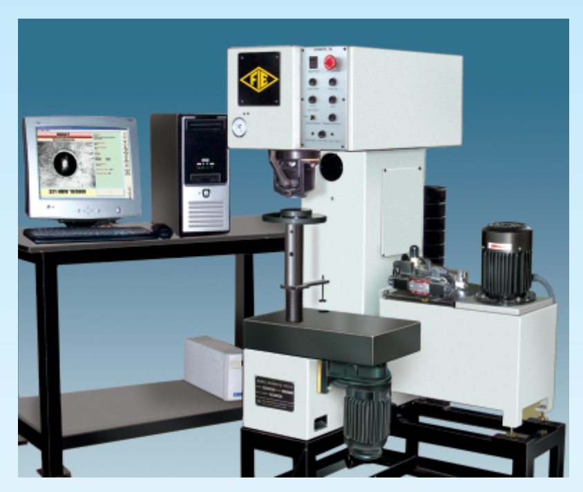
Computer, Ups and Computer table is not part of the Machine.

'FIE' Computerised Brinell Hardness Tester, Model B3000-PC-FA is fabricated from steel plates and is designed for precise loading system. It is fully automatic machine for production testing. Once the job is placed on testing table and press "Cycle Start" button. The job is raised and brought in contact with clamping device. Then indentor is swivelled and brought in vertical loading position. The loading operation starts. After preset dwelling timer, unloading operation starts. As soon as load is fully removed, the indentor is swivelled and the image is digitalized using a CCD camera fitted on machine and captured by the PC.