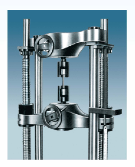
ATTACHMENT FOR TENSION TEST FOR SHOULDERED AND THREADED SPECIMENS